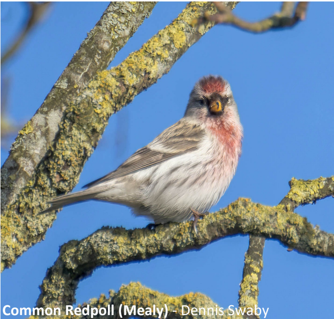
Common Redpoll (Mealy) - Dennis Swaby

Rode Heath: Pink-footed Goose, Redwing, Fieldfare