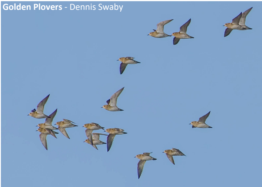
Golden Plovers - Dennis Swaby