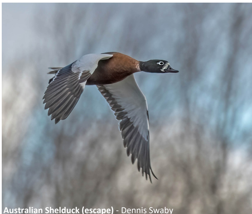
Australian Shelduck (escape) - Dennis Swaby