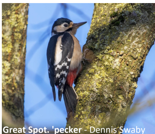
Great Spot. 'pecker

EHF, PHF, MGT, RF: Kingfisher, Green Woodpecker , Raven, Cetti's Warbler , Chiffchaff , Redwing , Fieldfare , Stonechat, Bullfinch, Greenfinch, Linnet, Common Redpoll (Mealy), Lesser Redpoll, Siskin, Yellowhammer