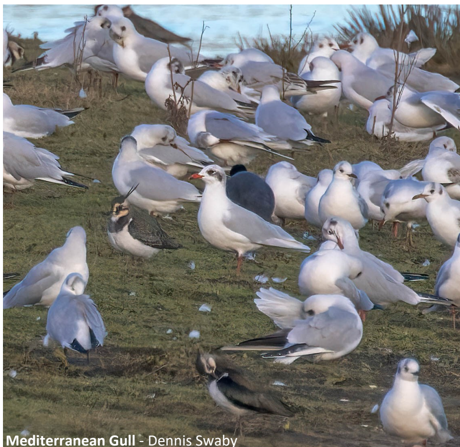
Mediterranean Gull