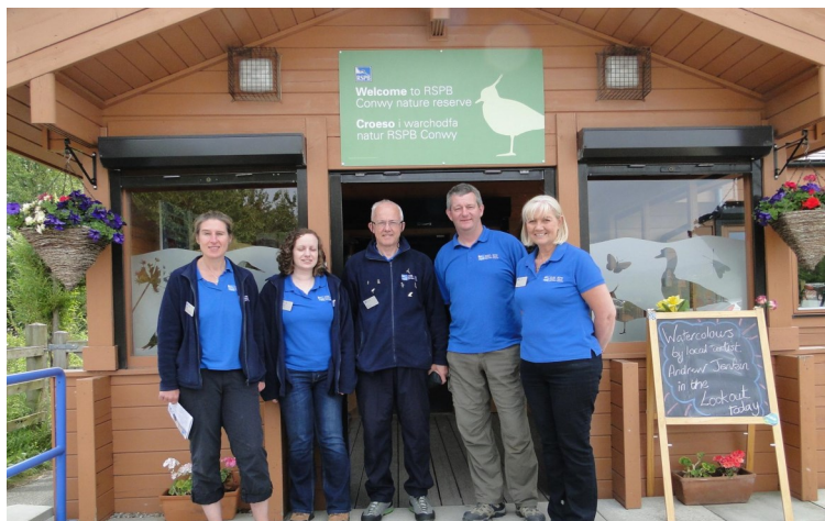
RSPB Conwy Visitor Centre - Wikipedia

The North Wales Coast has some fantastic birding sites, such as Llanfairfechan, NWWT The Spinnies and RSPB Conwy. If there is time, and the weather and light are favourable, we will also have short stops at Rhos-on-Sea and Kimmel Dunes LNR.