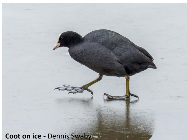
Coot on ice - Dennis Swaby