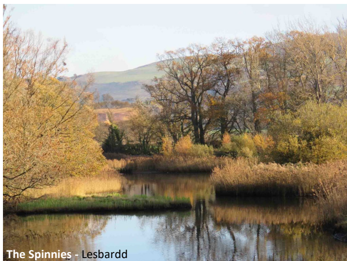
The Spinnies

The North Wales Coast has some fantastic birding sites, such as Llanfairfechan, The Spinnies and RSPB Conwy. If there is time, we will also have short stops at Llanddulas and Kinmel Dunes.