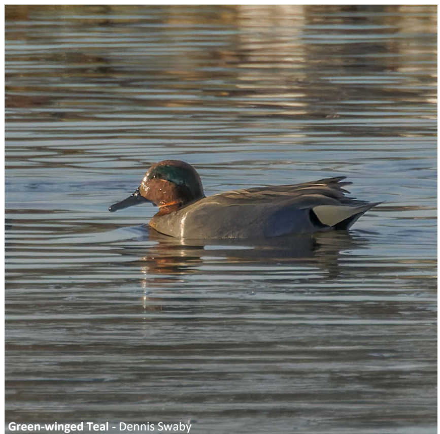
Green-winged Teal - Dennis Swaby