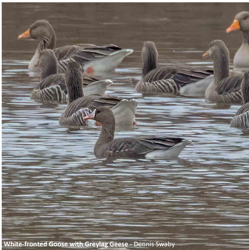
White-fronted Goose with Greylag Geese - Dennis Swaby