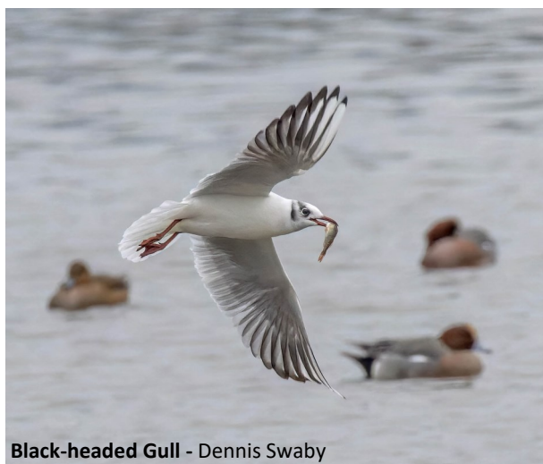
Black-headed Gull - Dennis Swaby