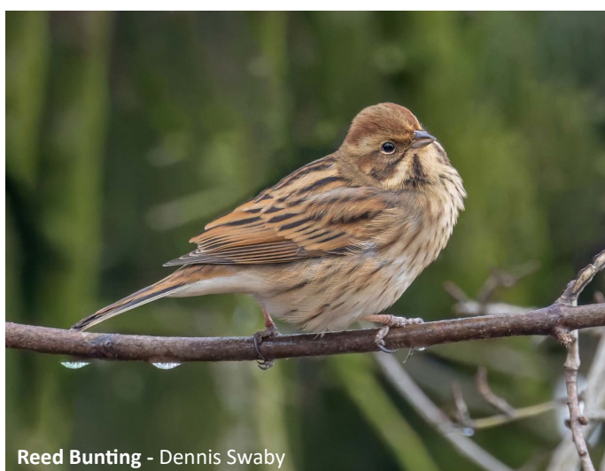
Reed Bunting - Dennis Swaby