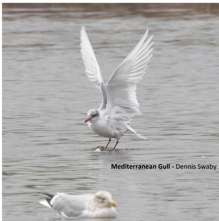
Mediterranean Gull