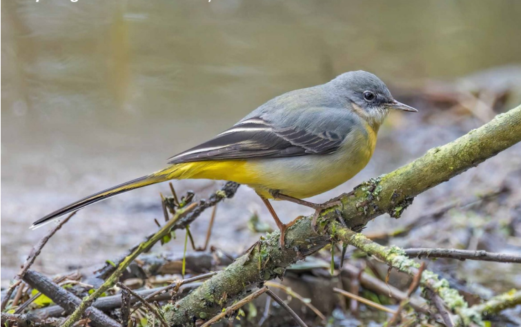
Grey Wagtail - Dennis Swaby

A full listing is on the website: https://www.secos.org.uk/sightings/