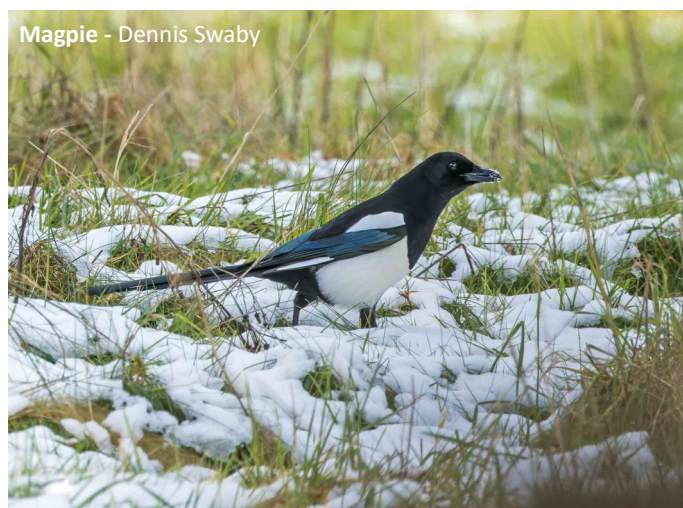
Magpie - Dennis Swaby

Sandbach - Sandbach Wildlife Corridor: Green-winged Teal, Water Rail, Yellowhammer