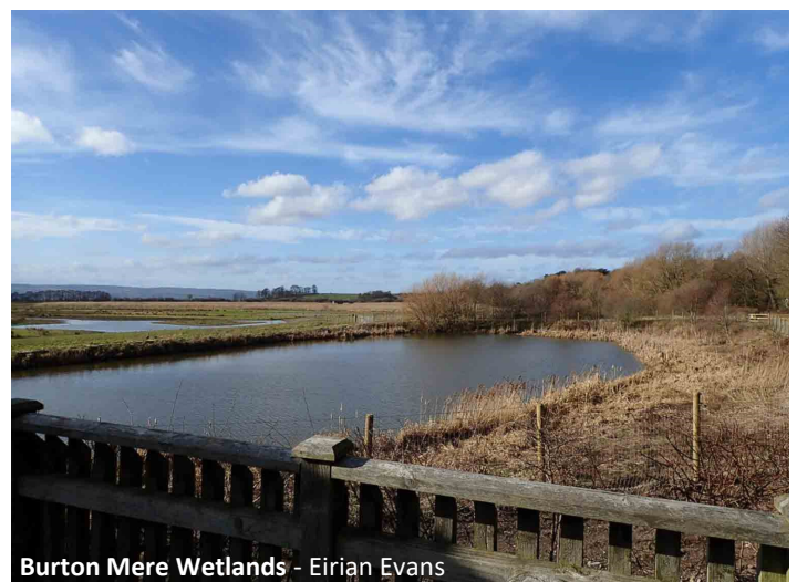
Burton Mere Wetlands - Eirian Evans

Located on the Dee Estuary, Burton Mere Wetlands spans the border between Wales and Cheshire. The reserve features a diverse landscape of reedbeds, marshland, scrapes, lagoons, ponds, narrow woodland strips, and mixed farmland. In spring, it comes alive with the sights and sounds of breeding birds.