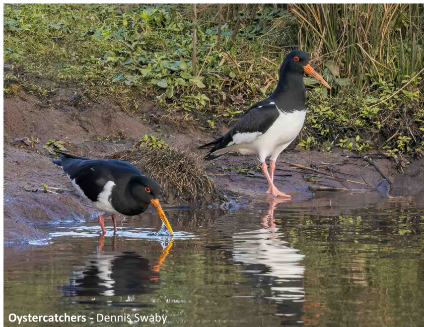
Oystercatchers