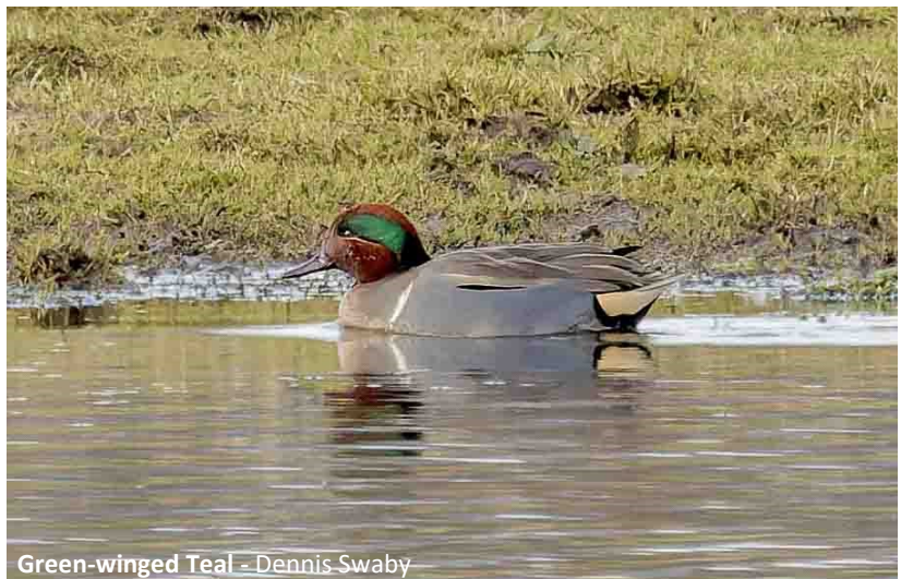
Green-winged Teal - Dennis Swaby