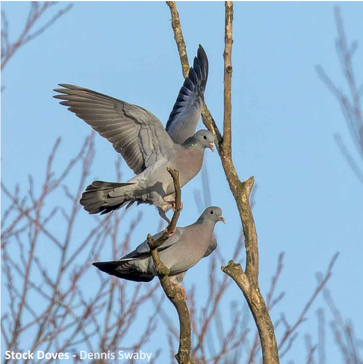
Stock Doves - Dennis Swaby

EHF/PHF/MGT/RF: Stock Dove, Woodpigeon, Collared Dove, Cormorant, Kingfisher, Great Spotted Woodpecker, Jay, Rook, Carrion Crow, Skylark, Cetti's Warbler , Chiffchaff , Goldcrest, Wren, Treecreeper, Song Thrush, Redwing , Fieldfare , Stonechat, Grey Wagtail, White Wagtail (alba) , Bullfinch, Greenfinch, Redpoll, Siskin , Reed Bunting