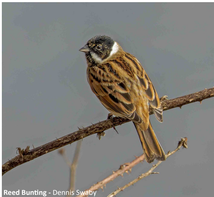
Reed Bunting

Rode Heath - Rode Pool: Egyptian Goose , Mandarin Duck, Shoveler, Gadwall, Goosander, Water Rail, Snipe, Little Egret, Great White Egret, Barn Owl, Kingfisher, Siskin