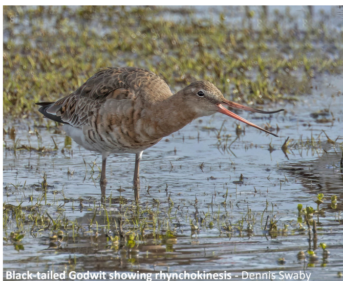
Black-tailed Godwit showing rhynchokinesis - Dennis Swaby