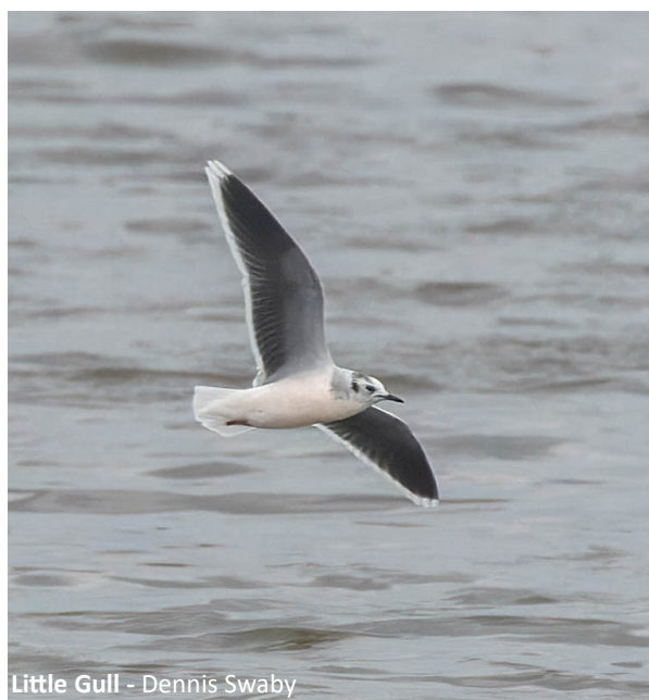
Little Gull - Dennis Swaby