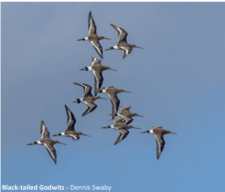
Black-tailed Godwits - Dennis Swaby