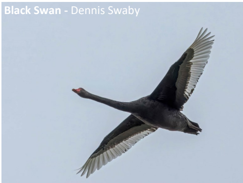
Black Swan - Dennis Swaby