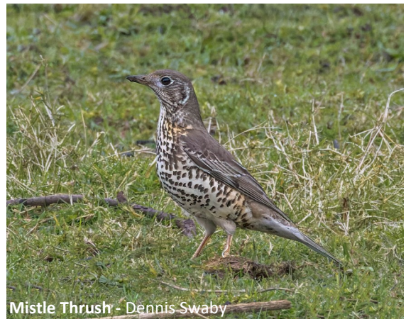
Mistle Thrush - Dennis Swaby