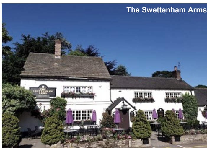
The Swettenham Arms