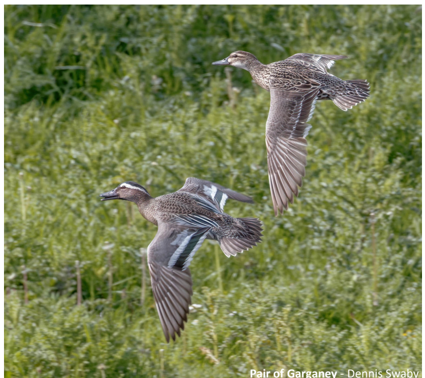
Pair of Garganey