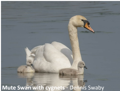
Mute Swan with cygnets