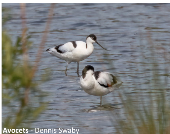
Avocets