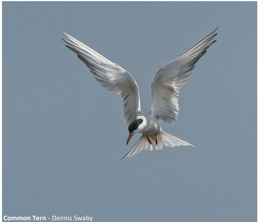
Common Tern