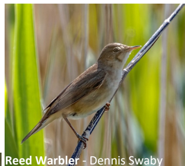
Reed Warbler - Dennis Swaby