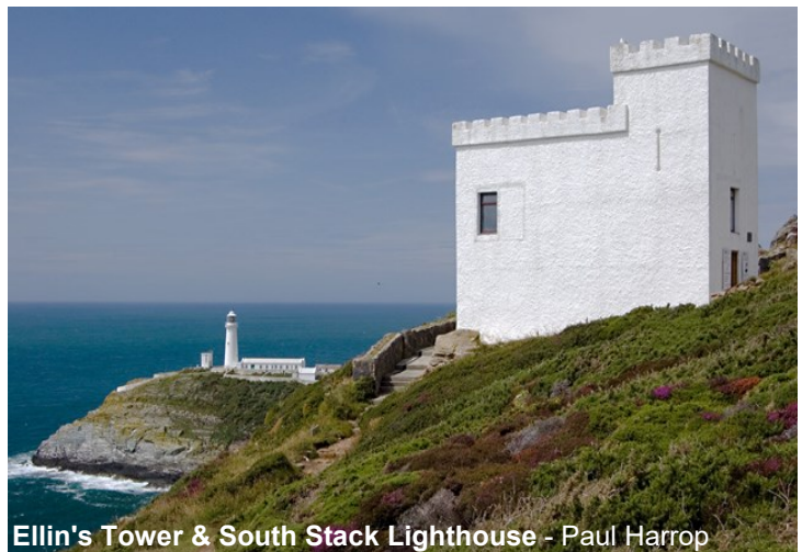
Ellin's Tower & South Stack Lighthouse - Paul Harrop