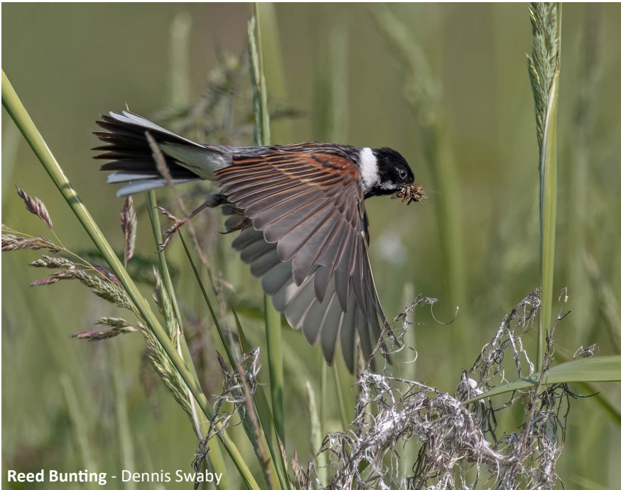
Reed Bunting - Dennis Swaby

EHF/PHF: Cuckoo , Black-tailed Godwit, Willow Warbler