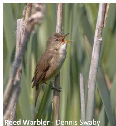
Reed Warbler - Dennis Swaby