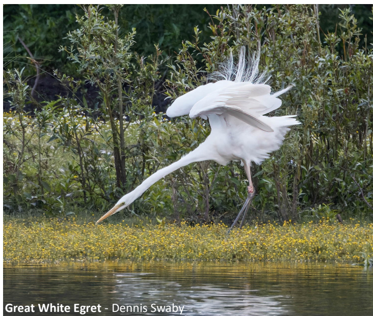
Great White Egret - Dennis Swaby