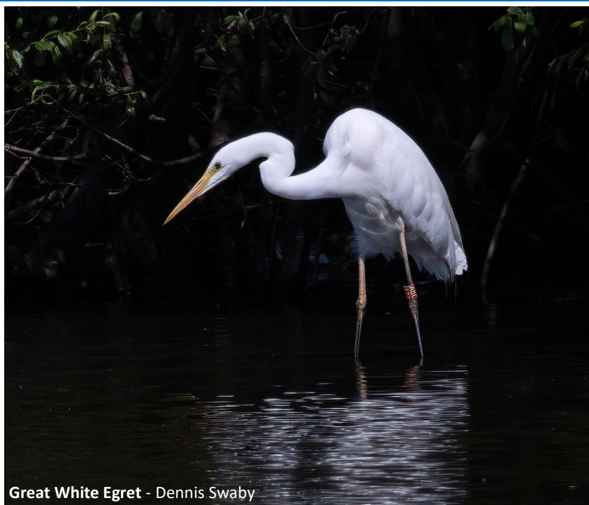
Great White Egret - Dennis Swaby