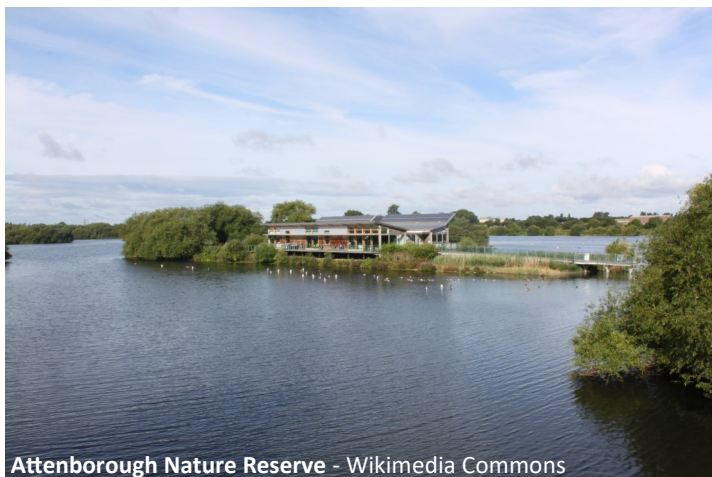
Attenborough Nature Reserve

Field Trip Attenborough NR Sunday 17 th September