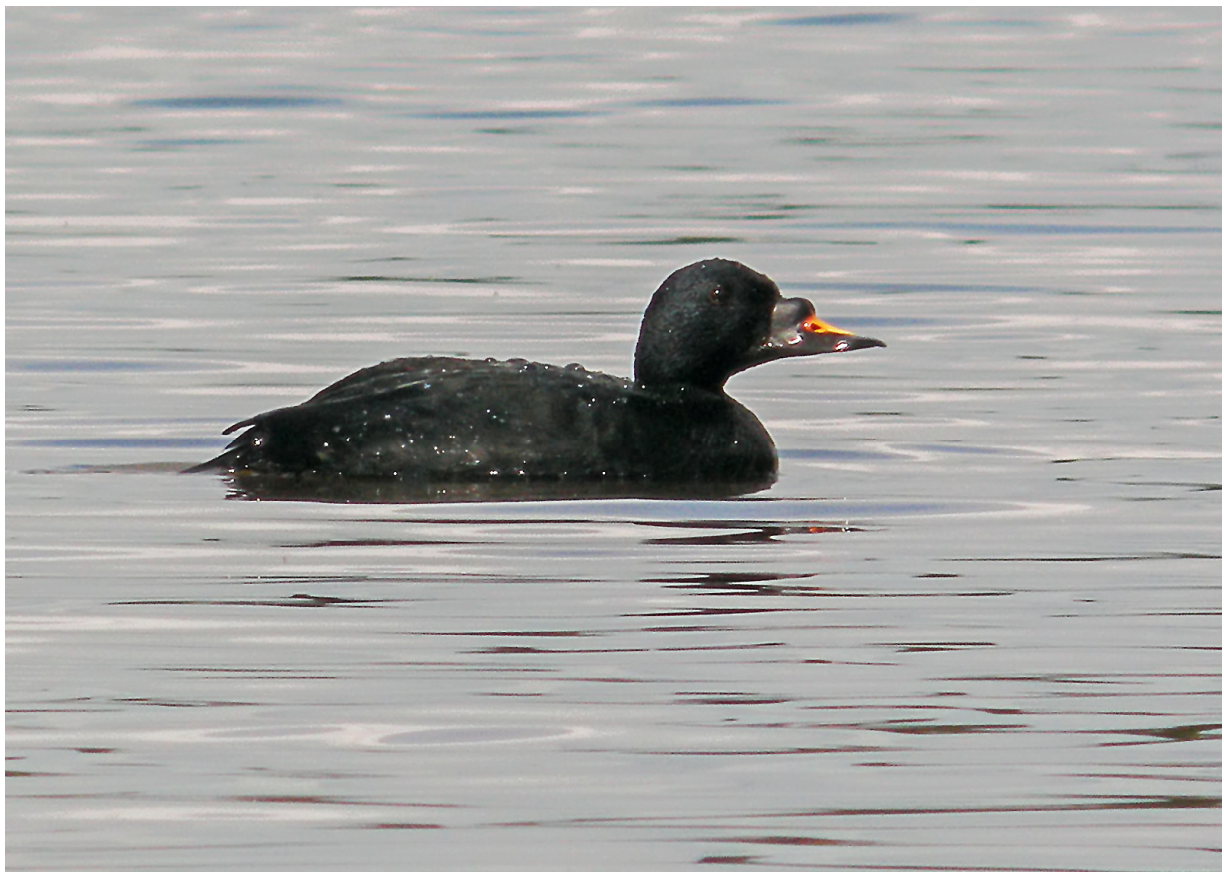
Common Scoter