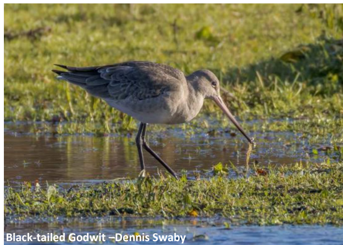
Black-tailed Godwit –Dennis Swaby