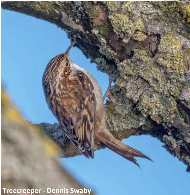
Treecreeper - Dennis Swaby