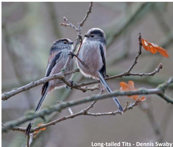
Long-tailed Tits