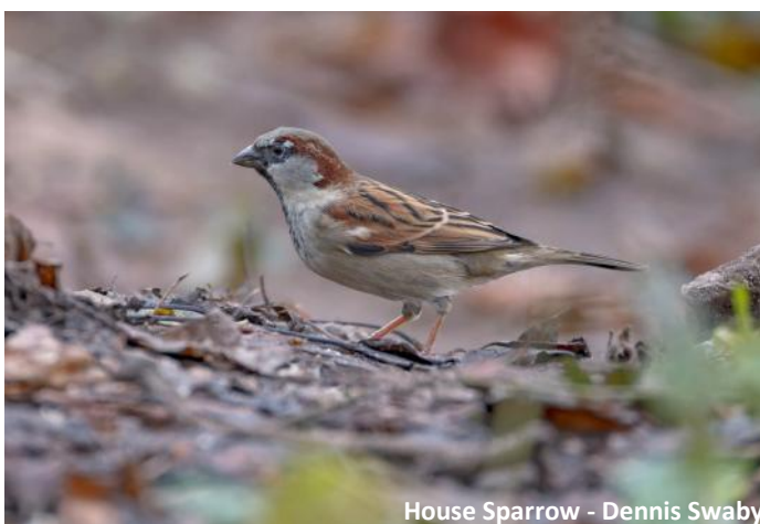
House Sparrow - Dennis Swaby

Rode Heath - Rode Pool: Egyptian Goose, Mandarin Duck , Shoveler, Teal, Tufted Duck, Goosander, Great Crested Grebe, Black-headed Gull, Lesser Black-backed Gull, Cormorant, Little Egret, Great White Egret , Grey Heron, Kingfisher