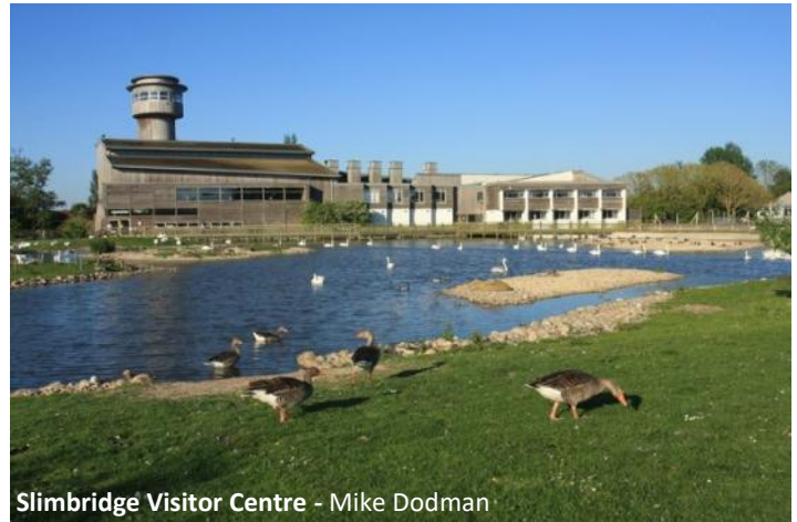
Slimbridge Visitor Centre

January is an excellent month to visit Slimbridge. Bird numbers are typically at their highest, with as many as 30,000 wintering ducks, geese, swans and waders present.