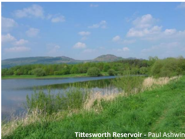
Tittesworth Reservoir - Paul Ashwin

Dammed in 1858 to harness the flow of the River Churnet, Tittesworth Reservoir was later enlarged in 1963 to become Staffordshire's second-largest waterbody. The site boasts two well-positioned bird hides and a network of thoughtfully maintained trails skirting the water's edge, offering excellent opportunities to enjoy both resident and passage birdlife.