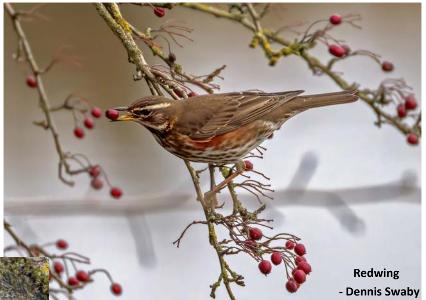
Redwing - Dennis Swaby

Sandbach - Moston: Collared Dove, Black-headed Gull, Herring Gull, Buzzard, Raven, Blue Tit, Great Tit, Long-tailed Tit, Chiffchaff, Wren, Treecreeper, Starling, Song Thrush, Mistle Thrush, Redwing, Blackbird, Fieldfare, Robin, House Sparrow