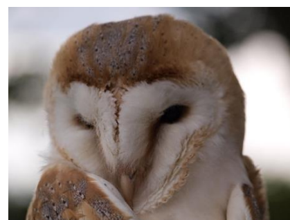
Figure 1 - Looking so shy

Most before was in 2018 when we had 49 pairs.