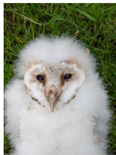
Figure 2 Only a mother could love it. Ugly turns into beautiful