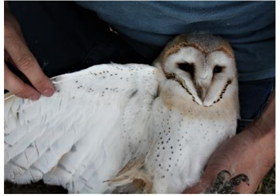
Figure 4 Spotty female

on behalf of South Cheshire Barn Owl Group