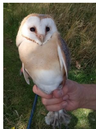
Figure 3 - Buff breasted female